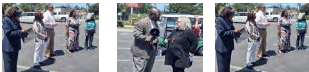
May 4, 2023