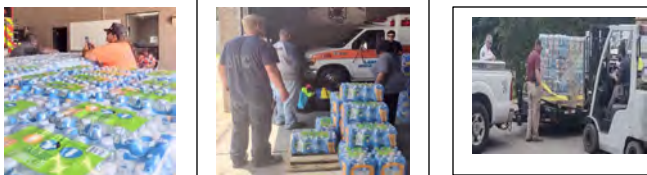
April 28, 2023