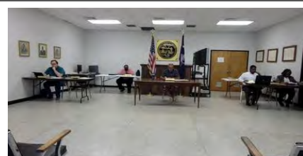
May 8, 2023