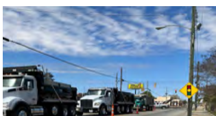
March 20, 2023