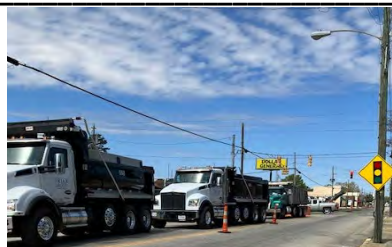
Repaving Main Street on Monday, March 20, 2023.

If you need help, call the Darlington County Communication Action Agency at 843-332-1135 to apply.