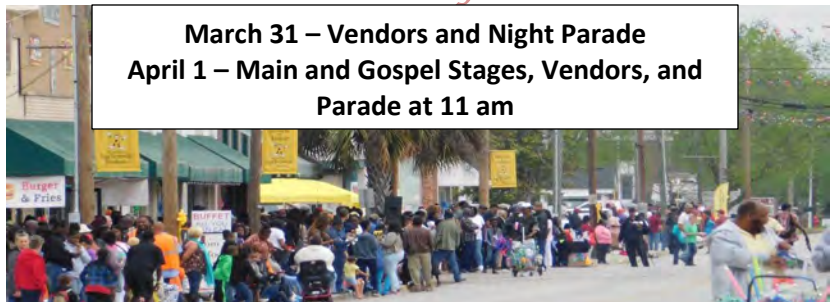
Ready for the Parade: 11:00 am Saturday (2022)

March 31 – Vendors and Night Parade April 1 – Main and Gospel Stages, Vendors, and Parade at 11 am