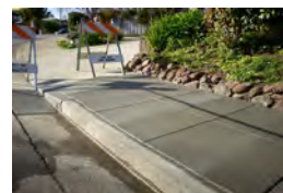
Main St., LAMAR

Each side will take approximately 1 week. The parking area for the side being repaired will be blocked until the work is complete.