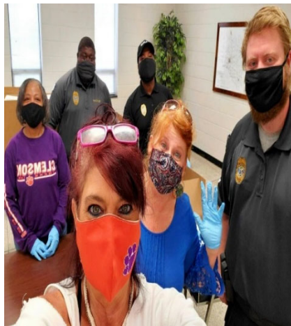
Thanksgiving Giveaway 2020