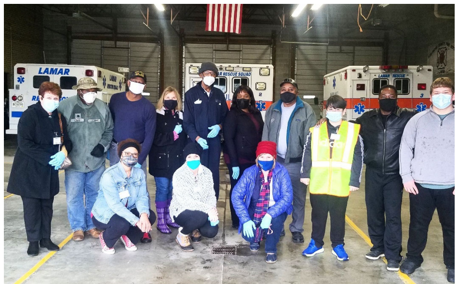
Harvest Hope Food Giveaway 2021

The event organizers would like for all local churches and merchants to decorate their establishments and join in the fun!