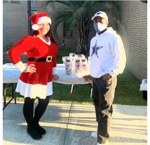
Christmas on Main 2020