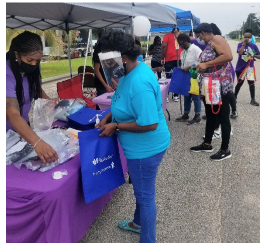
Health & Wellness 2021