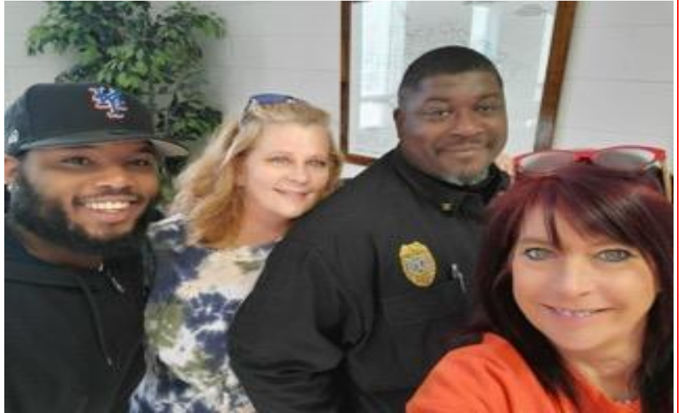
THANKSGIVING DINNER GIVEAWAY 2021