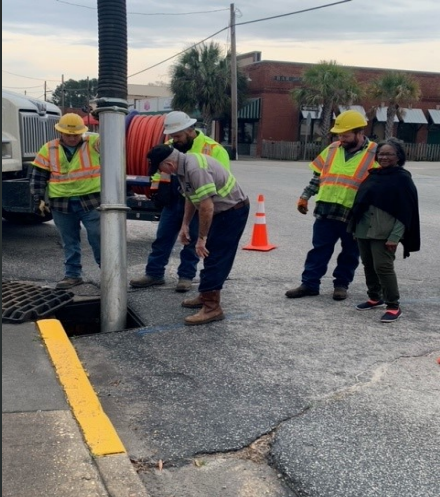
DOT Drain Work (Lamar)