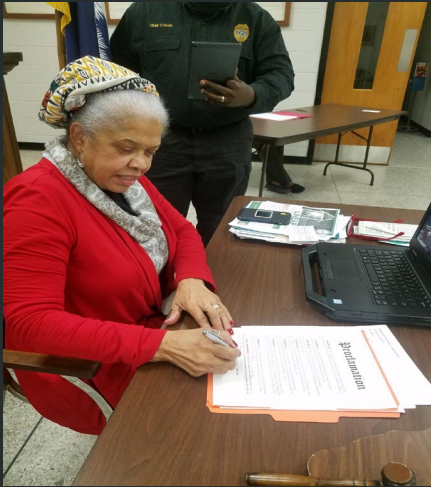
Donate Life Proclamation