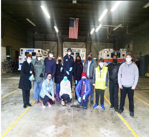
Food Giveaway (Lamar)