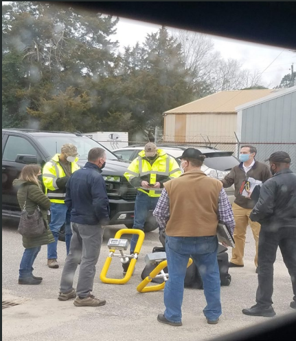
SERCAP Visit (Lamar)